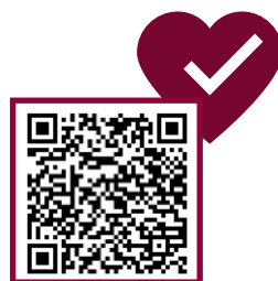
EMPLOYEE HEALTH CHECK