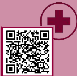
SEXUAL HEALTH SCREENINGS